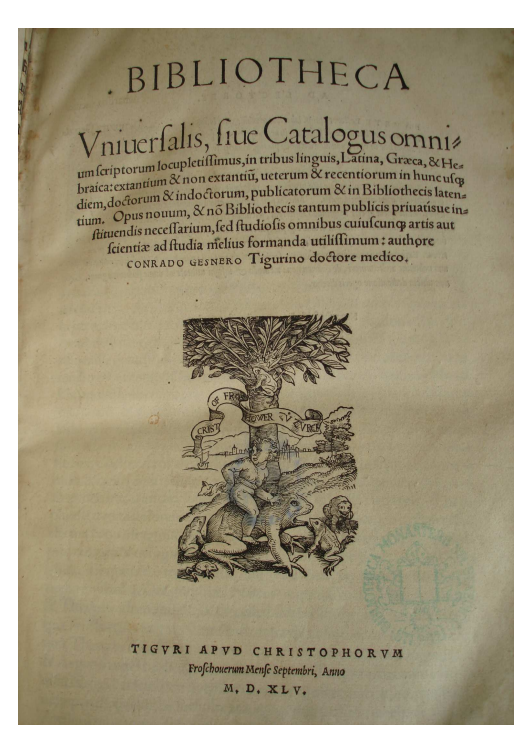
Figure 3 - Bibliotheca universalis , by Conrad Gesner, 1545. [ Livraria de São Bento – Old Books Collection].

Among the philosophical works there are: Opervm: Aristotelis , 1606, by Aristotle; De Dignitate: et augmentis scientiarum tomus I et II , 1779, the treatise on scientific methodology by Francis Bacon and Dilucidationes Philosophicae , the philosophy manual on logics, metaphysics and theology.