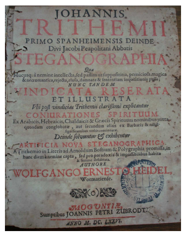
Figure 2 - Steganographia , by Johannes Trithemius, 1676. [ Livraria de São Bento – Old Books Collection]. (Source: Araújo, 2008:166. Reproduced under permission by author).

Among the works, Steganographia (Fig. 2), 1676 edition, by the Benedictine Johannes Trithemius (1462-1516) - Abbot of the Monastery of Sponheim - stands out. The book deals with the occultation of messages and establishes a dialogue with esoteric writings and codes. In contemporary terminology these areas would be characterized as suggestions, telepathy and hypnosis.