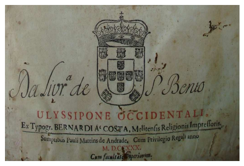
Figure 1 - Property mark from Tractatus varii: Opusculum de maioratus possessorio interdicto , by Manuel Álvares Pega, 1730. [ Livraria de São Bento – Old Books Collection].

Keeping fragments of its original characteristics along the years, the Library of Saint Benedict's Monastery of São Paulo today holds a collection of old books (16^{th} - 18^{th} centuries), of which few bear indications - reading or property marks (Fig. 1) - of having belonged to Livraria de São Bento <sup>2</sup> apart from revealing aspects of São Paulo's Benedictine culture.