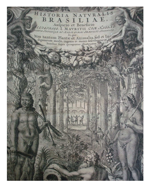
Figure 5 - Historia Naturalis Brasiliae by Guilielmi Pisonis, 1648. [ Livraria de São Bento - Old Books Collection].

In this sense, the study of reading and property marks constitutes a fundamental clue in which the materiality of the book is essential. Articulating with the elements of historical bibliography, the reading practices can be related to the medium, confirming how materiality affects the modalities of use and appropriation of the texts by the reader with the passing of time.